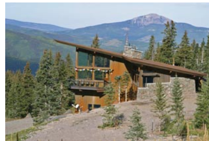
(Left) The road to the Burr Home. (top) The colors of the house blend into the surrounding area. (Above) The surrounding view is remarkable from any point on the property.

The exterior colors blended easily into the surrounding area, making this new home look as if it had always been there.