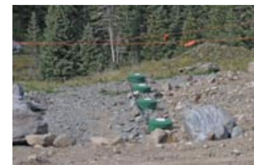
Buried in the bedrock are four one thousand gallon propane tanks