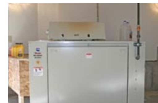
Onan 20kw Propane generator