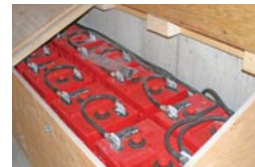
12 Rolls Surrette 4ks25ps Series 5000 Batteries

Total array rated power 2.4 kw consisting of 16 BP 150-S photovoltaic panels, nominal voltage of 24 vdc. Storage 12-4 volt Rolls Surrette 4ks25PS batteries 1347 amp hours each for total of 2694 amp hours. Two Trace (Xantrex) SW4024 inverters wired for 110/220 vac split phase, includes Outback AC and DC power distribution panels. Two Trace C40 charge controllers. One 20kw Onan propane fired generator for backup derated to 10kw due to altitude of 11,000 feet. 4 in-ground Propane tanks holding 1000 gallons each.