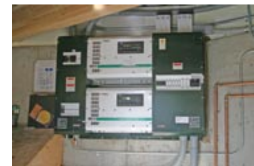
Two Xantrex 4024, (Center) Outback DC (left) and AC (right)