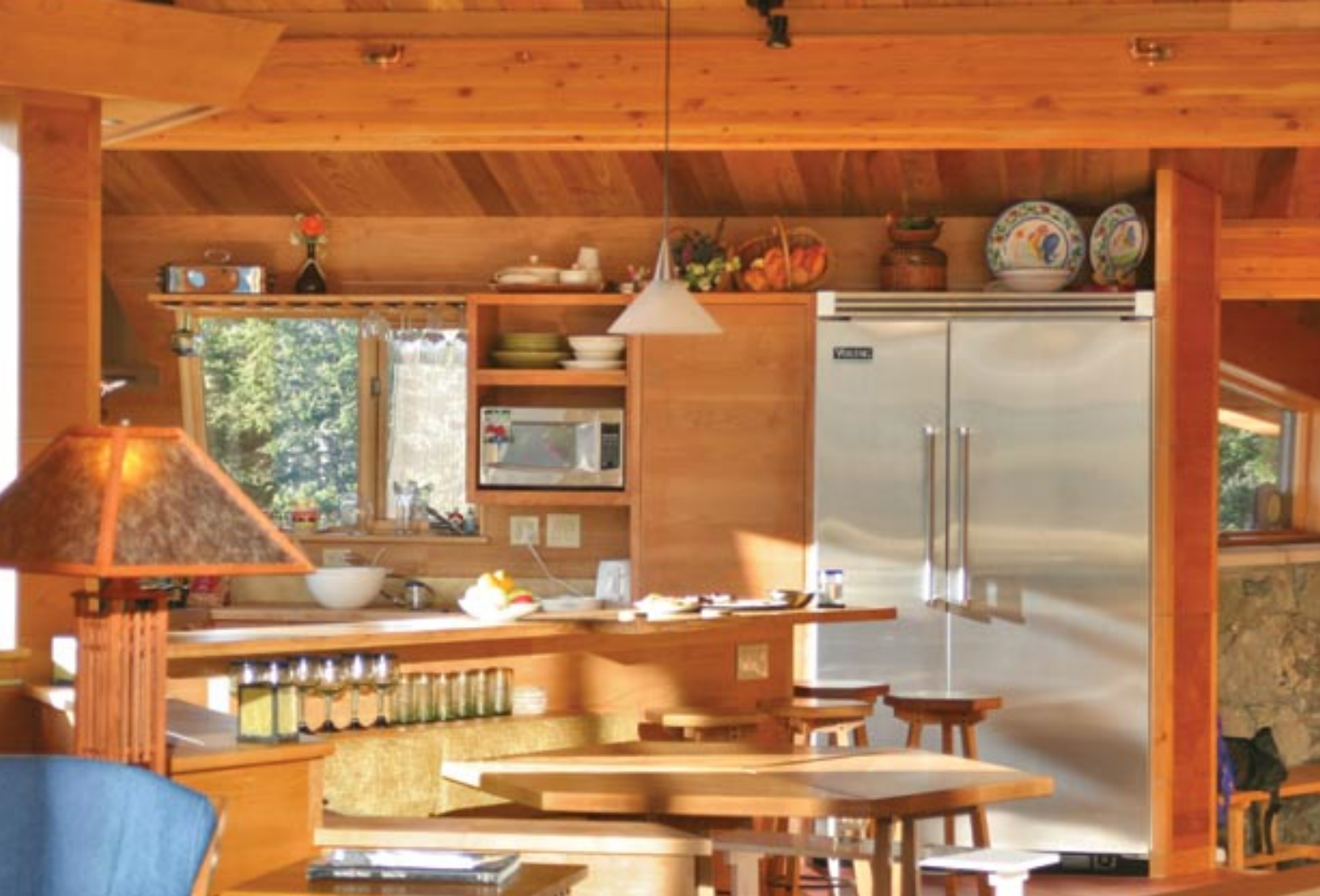
The kitchen is warm and airy. Built-in storage and an oversized commercial refrigerator/freezer keeps them well stocked for long winter days and nights.

through tubing embedded in the floors. Four one thousand gallon propane tanks are buried in solid bedrock in front of the house. Although this propane is used mainly for heating hot water and for cooking, it is unlikely that a large quantity of propane will be used each season for general heating purposes, because the heavy insulation of the house and passive solar heating should be adequate for all warming needs.