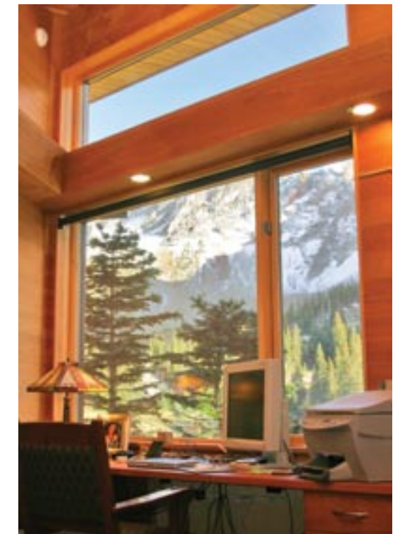
The office is equipped with the latest high tech gear, including high speed internet.

When temperatures stay severe for long periods of time and are then accompanied by cloudy weather, a unique supplemental heating system is employed. Plastic tubing was embedded into the floor slabs during construction. A propane-fired boiler heats water that is then circulated