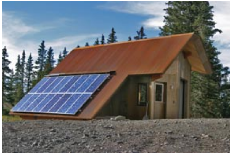
The powerhouse. The heart of the Burr residence energy station. Shown are the 16 BP 150 watt solar electric panels.

Bright and early next morning, we began the job we went there to do: that is, to investigate every aspect of this magnificent structure and find out how its inhabitants live and enjoy the home and its surroundings. Chuck explained that before the building began, he and Theresa, along with the aid of Leif Juell (Alternative Power Enterprises) mapped out what they felt would be needed in the way of power, not only to amply supply the finished home, but for use in the construction of the home. They decided that sixteen BP 150 photovoltaics, and two Xantrex 4024 inverters with an Outback Power distribution system, was the path to take. With the basic system in place, construction could begin. The home was completed in July of 2003.