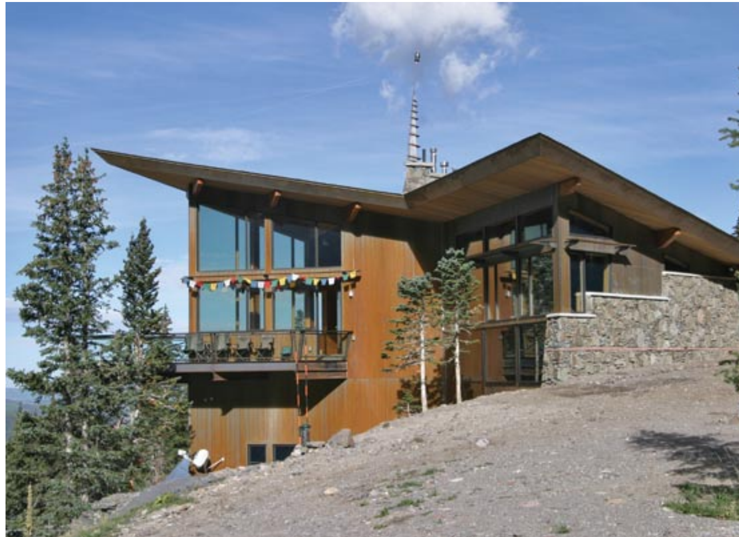
The generous use of windows with a southern exposure help to warm the home in the winter.

Every aspect of this home was designed to maximize energy efficiencies. A generous but balanced window layout on the southern exposure allows passive heating anytime the sun is shining. The heat collected during the day in the second floor concrete slab slowly reradiates throughout the home in the evening, keeping it very comfortable. A fan installed in the high ceilings directs warm air down under the slab to keep temperatures regulated. Use of SIP or Structural Integrated Panels for most of the exterior walls as well as the roof insures a more than adequate insulation barrier to severe temperatures. The SIP panel is a lamination of polystyrene or Styrofoam between two layers of plywood or oriented strand board. The home is built directly on bedrock so a generous use of steel beams and concrete for most of the main structure disallowed the use of conventional batt type insulation. The SIP panels allowed nearly perfect sealing and high R value insulation without creating thermal bridges.